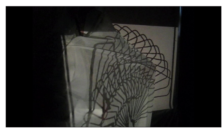
Figure 4.4: (7.34) Jennifer Pike with Veryan Weston, 2007.