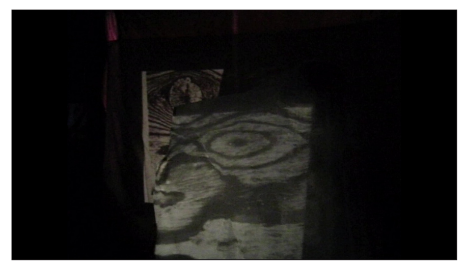
Figure 4.1: (02.17) Jennifer Pike with Veryan Weston, 2007.