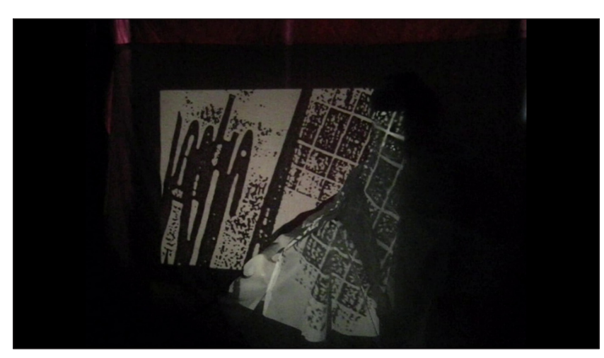
Figure 4.2: (2.49) Jennifer Pike with Veryan Weston, 2007.