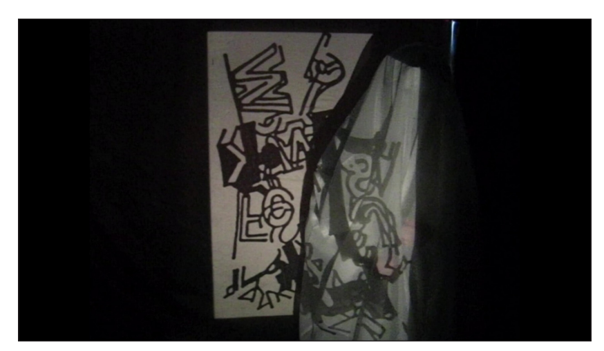
Figure 4.3: (06.24) Jennifer Pike with Veryan Weston, 2007.