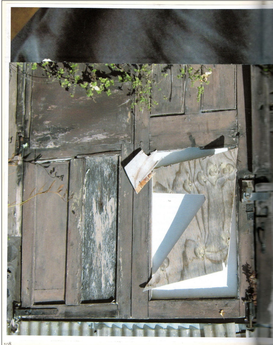
Figure 6: Page 108 from SPUTTOR (© Allen Fisher, 2014).

oppression of humankind' on the other. 67 In a method that recalls Blake's parallels between 'The Divine Image' and 'A Divine Image', Fisher's 'Human Poems' examine empathy and oppression, and thus act as an echo or – alternatively – a counterpoint to the violence that is exhibited through the book's visual qualities. 68 SPUTTOR , as a