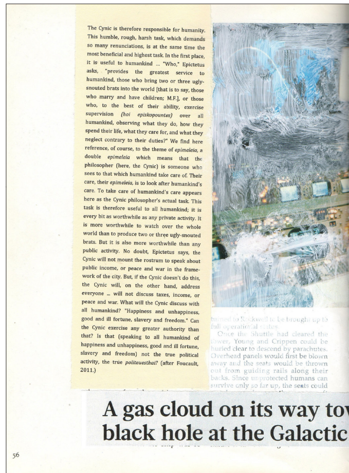
Figure 2: Page 56 from SPUTTOR (© Allen Fisher, 2014).

critical invention. This bears a resemblance to Fisher's arguments from 'Confidence in Lack', where the vital frailties and vulnerabilities of 'sensitive thinking' are necessarily in opposition to the logic of 'paternal and public [thought]'. 55 The poem re-articulates this conflict, although it modifies the earlier terminology: the dangers of public thinking are now represented by national thought, while critical invention substitutes sensitive thinking. However, these pages do not simply verbalise these oppositions. On a visual level, SPUTTOR 's collagist aesthetic performs them on the page. The clippings from Foucault and Fisher conceal and erase Wilson's original text, and this dual act of defacement and effacement is further expressed through